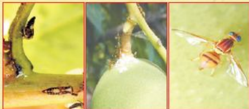
(a) : Hopper nymphs

Management : Adult fruit fly can be controlled by bait sprays of carbaryl (0.2%) + protein hydrolysate (0.1%) or molasses starting at pre-oviposition stage during April-May. The spray is repeated once again just after 21 days.