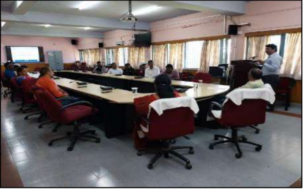
ICAR-IISWC, Research Centre, Vasad