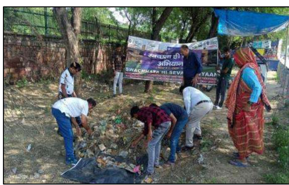
ICAR-IISWC, Research Centre, Ballari