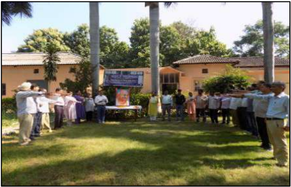
ICAR-IISWC, Research Centre, Datia