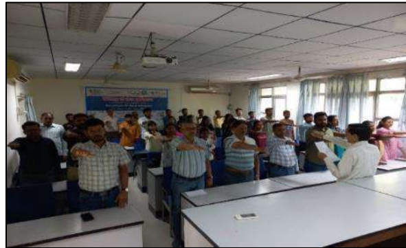
ICAR-IISWC, Research Centre, Udhagamandalam