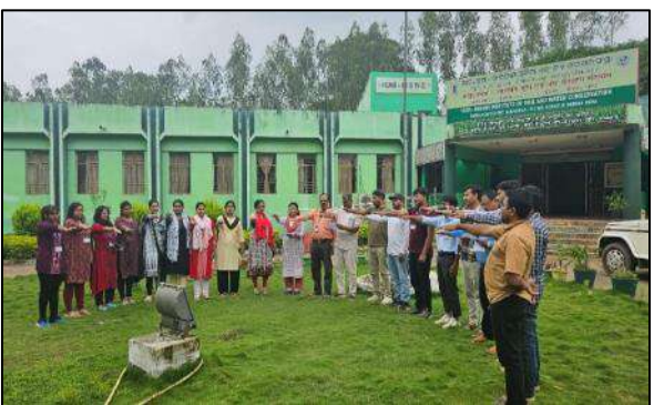
ICAR-IISWC, Research Centre, Kota