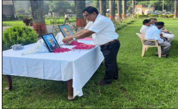
ICAR-Indian Institute of Soil and Water Conservation, Research Farm, Selaqui, Dehradun