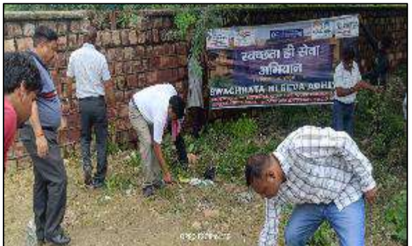
ICAR-IISWC, Research Centre, Ballari