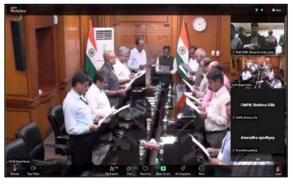
ICAR-IISWC, Research Centre, Vasad