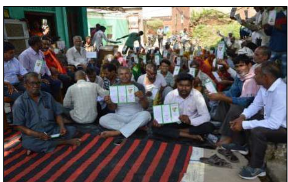
ICAR-IISWC, Research Centre, Koraput