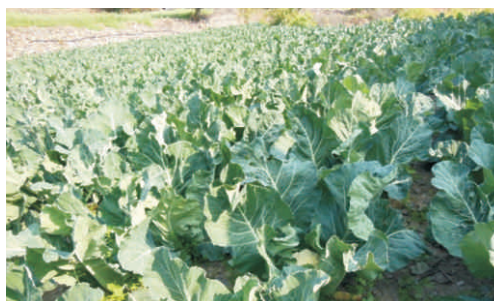
Cauliflower grown with harvested water