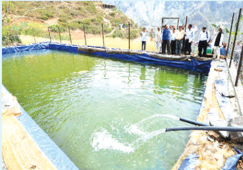
Harvesting Spring Water for Doubling Farmers Income