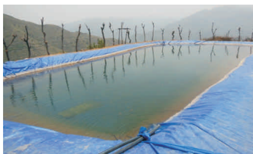
Developed water resource in Sainj

Traditionally, cereals, pulses, vegetables and fruits are cultivated in these villages under rainfed condition. Based on detailed field survey, technological interventions, spring water harvesting in particular, were taken-up in participatory mode. Farmers adopted cultivation of off-season vegetables - tomato, cauliflower, sweet peas, capsicum, etc. with assured irrigation facility developed by inter-watershed water transfer based spring water harvesting by laying gravity fed HDPE pipe line. Presently, a total of 670 m 3 water is available to these farmers in 24 hours in the two villages, which has led to 3.17 times increase in net irrigated area. A total of 165 farmers were initially associated with these interventions of participatory water resource development in Hattal and Sainj, who had adopted the cultivation of off-season vegetables in about 33.3 ha area with assured irrigation facility developed in their villages. After four years of project period, during 2017, these farmers produced tomato, cauliflowers and other vegetables worth Rs 411.08 lakhs, and average family income from agriculture rose to 7.71 times. In these villages, before this project a total of only 34 families were engaged in agriculture, which has increased to 99 (2.91 times). Reverse migration of 12 families has been observed in Sainj village where number of farmers had abandoned their fields due to scarcity of water.