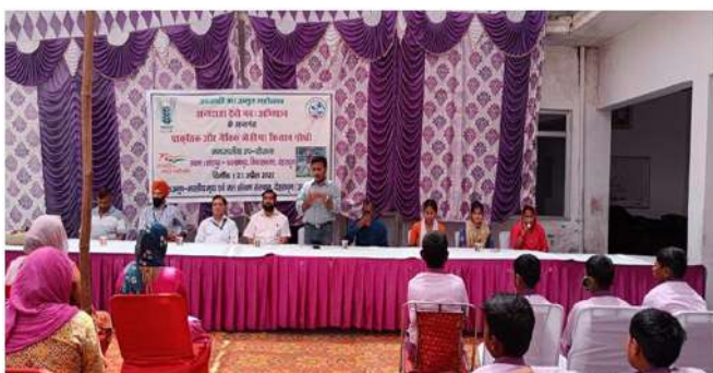
➤ Kisan goshti on "Annadata Devo Bhawa"

A Kisan Goshti was organised on 23 rd April, 2022 at Saheeddwala Grunt, Bhagwanpur Block, Haridwar District, Uttarakhand a, village under SCSP programme