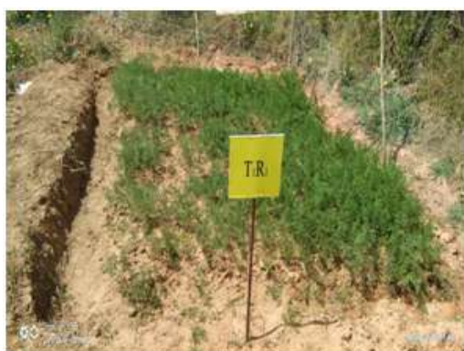
Control (no biochar)

Highly acidic lateritic soils of Western Ghats are nutrient deficient and grossly poor in overall quality, as the base nutrients such as calcium, potassium and magnesium are leached severely. Severe acidity and low nutrient availability results in marked reduction in crop productivity. The manures, applied by the farmers, were converted into biochar (fully or partly). Biochar was prepared with four pyrolysis temperatures viz 450, 600, 750 and 900°C and five doses viz., 4, 8, 12, 16 and 32 t ha -1 from FYM and Poultry Manure (PM) were applied. There were two liming treatments with dolomite, one with blanket recommendation of 5 t ha -1 and another was Soil Test Based (STB) application of 14 t ha -1 along with absolute control.