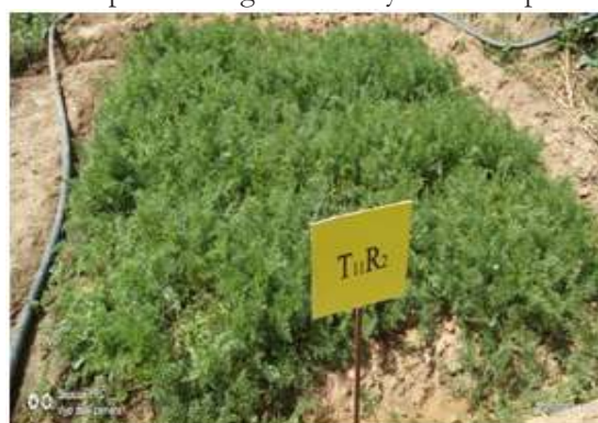
PM biochar (32 t ha -1 )

The soil incubation studies conducted in temperate ecosystem (Udhagamandalam) revealed that the poultry manure (PM) biochar raised the soil pH to the desired level i.e. towards neutral range whereas FYM biochars did not raise the pH of acidic soil. Exchangeable acidity was found to be drastically reduced from 0.38 to 0.09 meq/100 g with the application of biochar at the rate of 4 to 32 t ha -1 . Biochar prepared with 600°C and application at the rate of 8, 16 and 32 t ha -1 was effective to maintain required level of soil pH. It was found that the PM biochar application at the rate of 8 t ha -1 onwards increased the soil pH more than 5.5, at the same time the application of PM biochar at the rate of 32 t ha -1 maintained the pH up to 6.39 up to 30 th day. Application of biochar of alkaline material neutralizes soil acidity, improves soil quality, increases retention properties of soil and improves the growth and yield of crops.